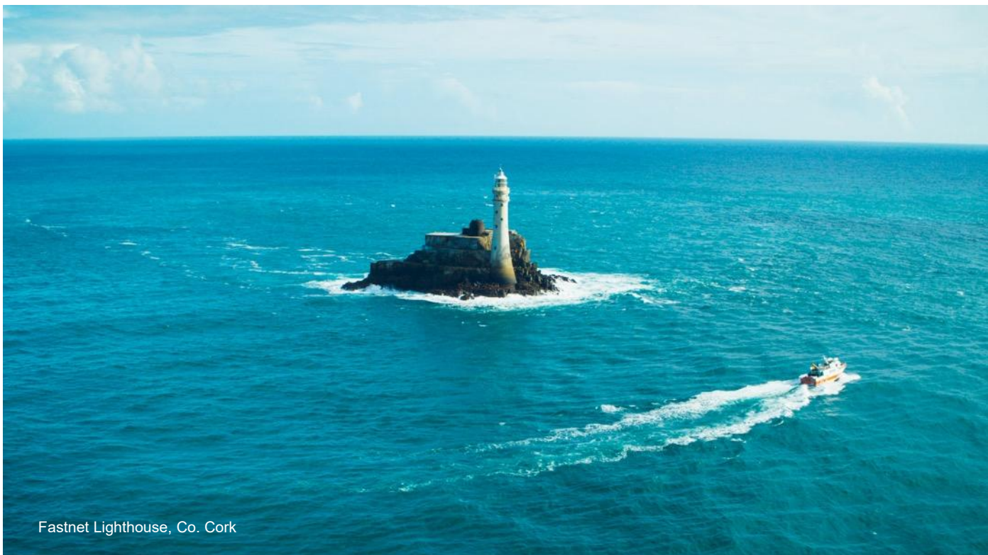
Fastnet Lighthouse, Co. Cork

that ultimately underpins significant accessibility. In addition, the project may entail the provision of customary amenities such as parking, restaurants etc. Provided that the provision of access represents a typical commercialisation strategy, and that any ancillary commercialisation is ordinarily incidental to the principal activity, then that should not prevent an applicant seeking to rely on recourse to the underlying GBER exemption 12 .