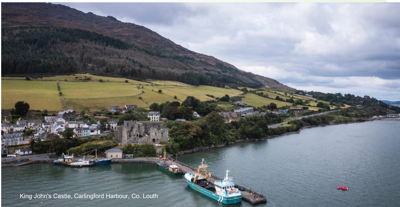
King John's Castle, Carlingford Harbour, Co. Louth

See Annex 4 for the Regional Aid Map for Ireland 2022-2027.