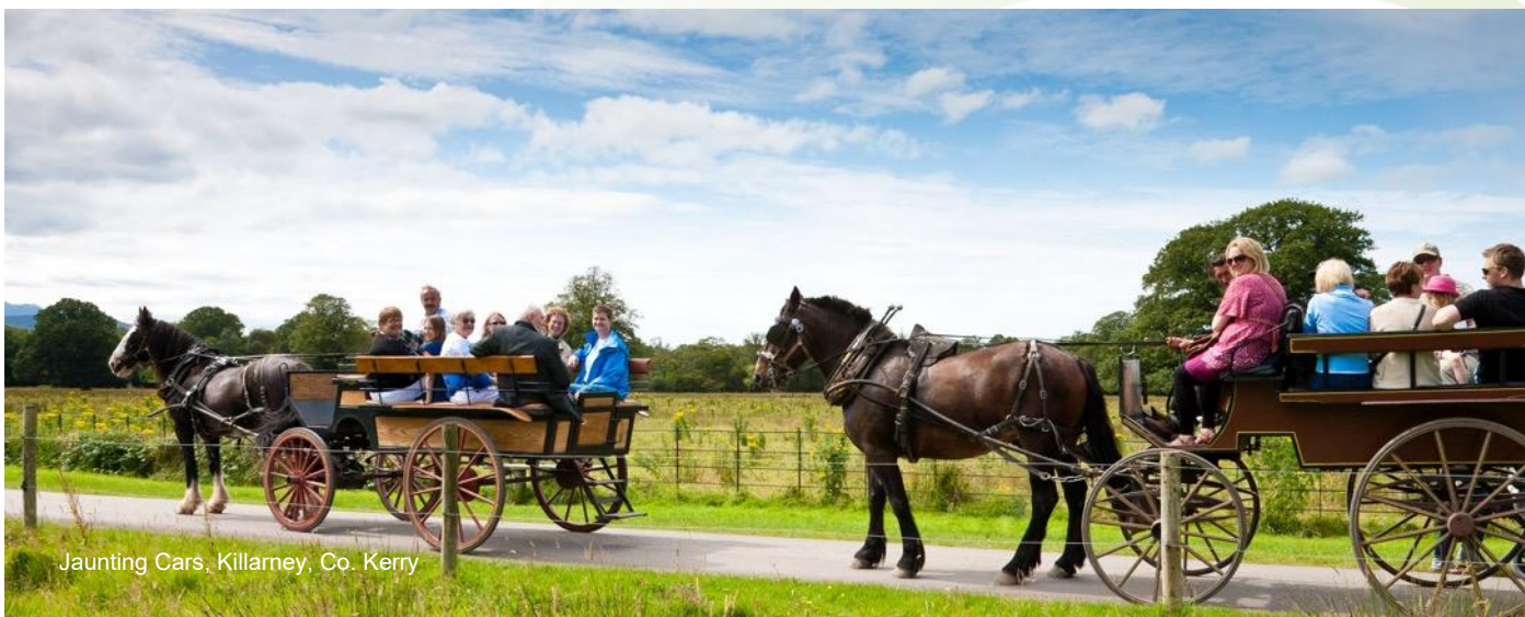
Jaunting Cars, Killarney, Co. Kerry

Finally, under the GBER there are distinctions made for certain purposes between micro, small, medium and large enterprises. Although not generally relevant with respect to the identified exemptions, they may be with respect to regional investment aid. As such, they are set out in Appendix 9.