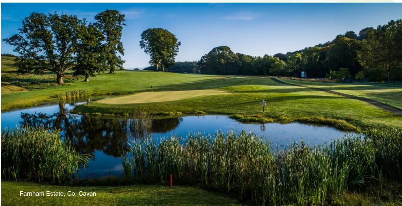
Farnham Estate, Co. Cavan

For aid not exceeding €2.2 million, the maximum amount of funding may be set at 80% of eligible costs.