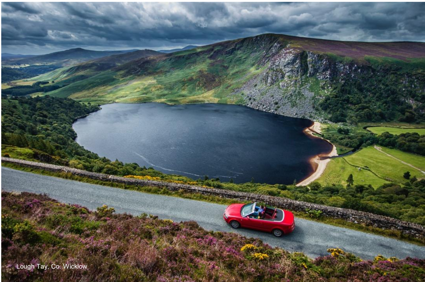
Lough Tay, Co. Wicklow

costs, materials, contracted services, communications, energy, maintenance, rent, administration, but exclude depreciation charges and the costs of financing if these have been covered by investment aid. Discounting revenues and operating costs using an appropriate discount rate allows a reasonable profit to be made.