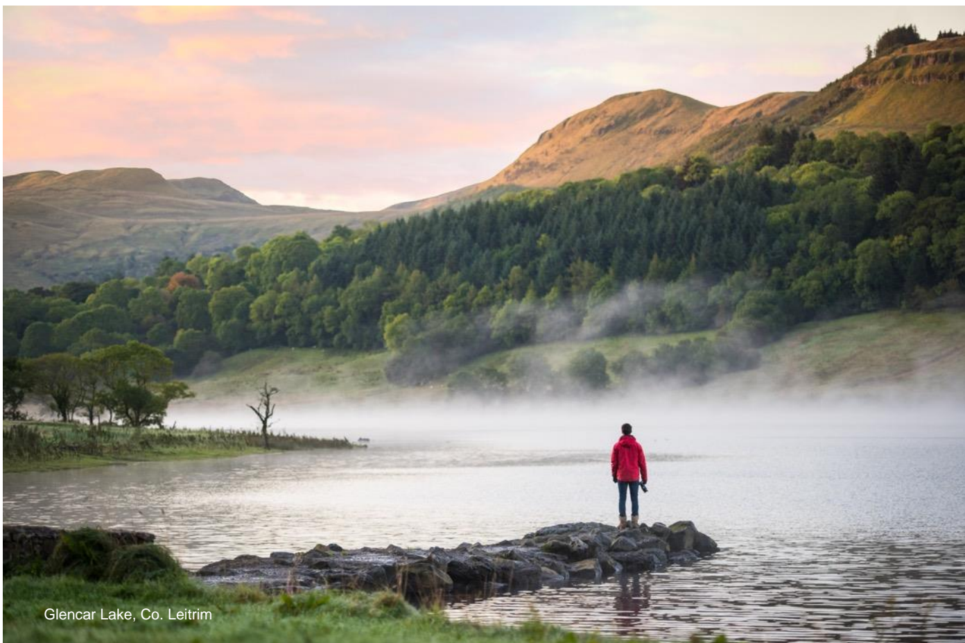
Glencar Lake, Co. Leitrim