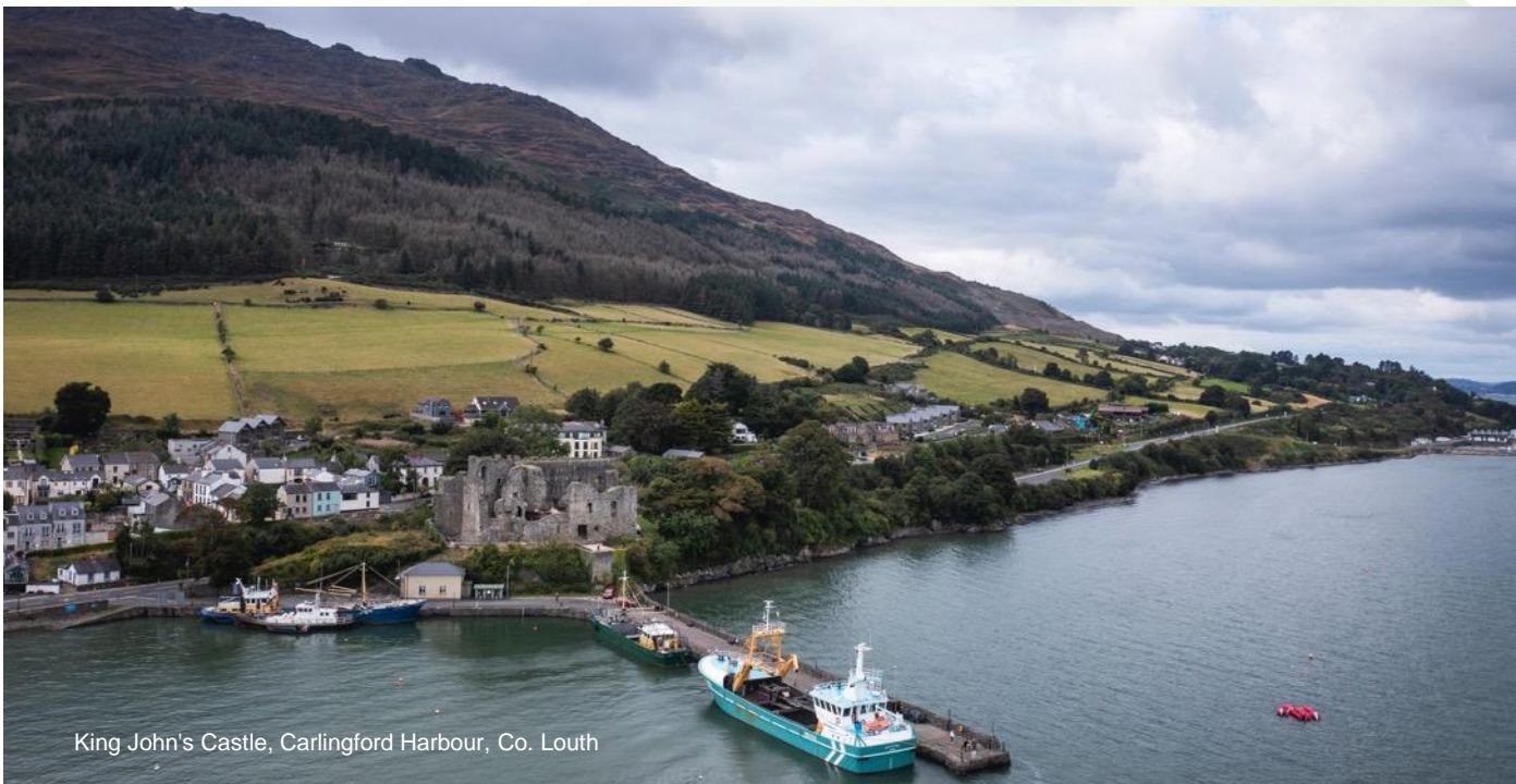
King John's Castle, Carlingford Harbour, Co. Louth

See Annex 4 for the Regional Aid Map for Ireland 2022-2027.