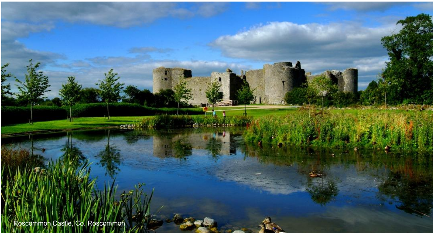
Roscommon Castle, Co. Roscommon

Council Regulation (EU) 2017/1084, Commission Regulation (EU) 2020/97, Commission Regulation (EU) 2021/452, Commission Regulation (EU) 2021/1237, Commission Regulation (EU) 2023/917, Commission Regulation (EU) 2023/1315 and the Commission Notice on the notion of State aid of 19th July 2016 1 ('the Notice'). The Notice is not and cannot be a definitive statement of law. Instead, it represents the understanding of the Commission of the current law, as well as indicating its likely approach to technical matters falling within its discretion. Subject to those limitations, it will be used to inform Fáilte Ireland's approach to these matters.