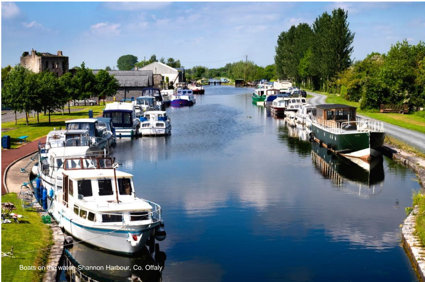
Boats on the water, Shannon Harbour, Co. Offaly

9.2 Within the SME category, a micro-enterprise is defined as an enterprise which employs fewer than 10 persons and whose annual turnover and/or annual balance sheet total does not exceed EUR 2 million.