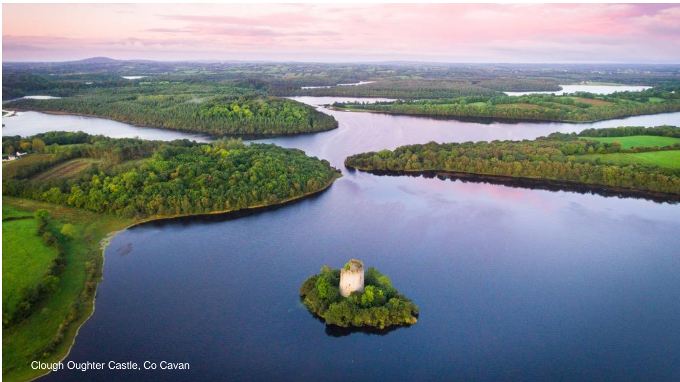
Clough Oughter Castle, Co Cavan

Fáilte Ireland will not provide grant aid in this category of over €2.2 million per undertaking per project.