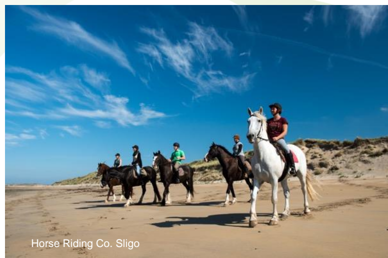
Horse Riding Co. Sligo

The use of this handbook is at the user's sole risk. Fáilte Ireland shall have no liability for any loss or damage howsoever arising, be it by negligence or otherwise, as a result of use or reliance upon the information in this Handbook. Users should be aware that this content is not intended to be comprehensive nor to replace or override any legislative provisions, or published guidelines and procedures. At all times, the primary documentation, guidelines and/or legislation should be consulted. As a result, applicants are free (and encouraged) to take legal advice as appropriate on how State aid rules apply in their particular situation.