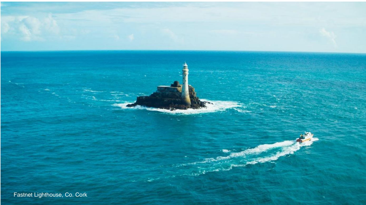
Fastnet Lighthouse, Co. Cork

that ultimately underpins significant accessibility. In addition, the project may entail the provision of customary amenities such as parking, restaurants etc. Provided that the provision of access represents a typical commercialisation strategy, and that any ancillary commercialisation is ordinarily incidental to the principal activity, then that should not prevent an applicant seeking to rely on recourse to the underlying GBER exemption 12 .