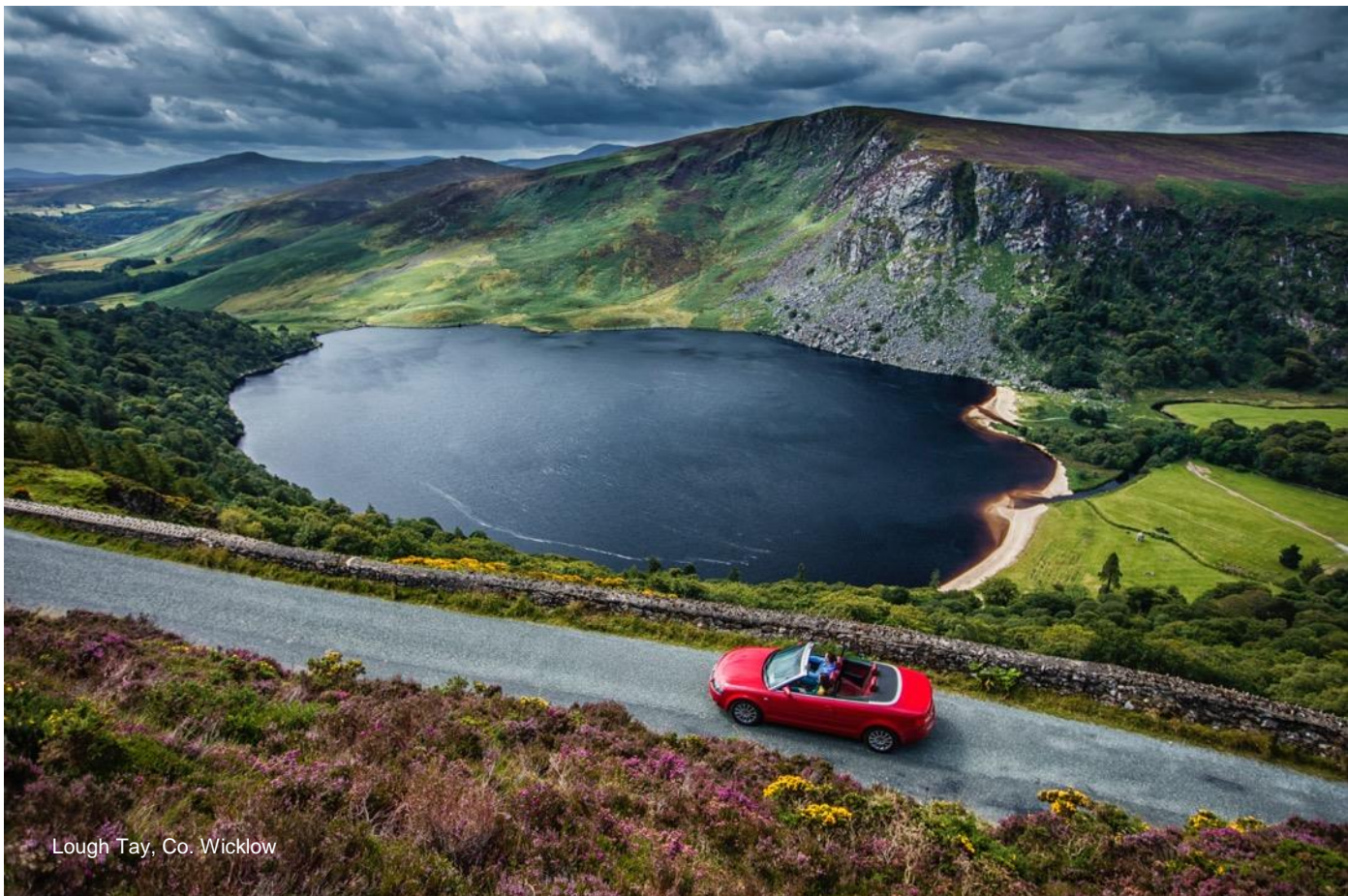
Lough Tay, Co. Wicklow