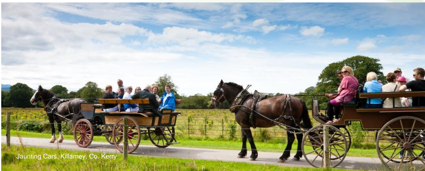
Jaunting Cars, Killarney, Co. Kerry

Finally, under the GBER there are distinctions made for certain purposes between micro, small, medium and large enterprises. Although not generally relevant with respect to the identified exemptions, they may be with respect to regional investment aid. As such, they are set out in Appendix 9.